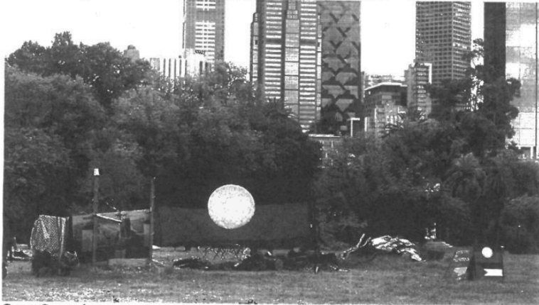
Camp Sovereignty set up at Kings Domain.

The Gunaikurnai man organised a 60-day sit in at the location 18 years ago, but this time plans to remain “forever”.